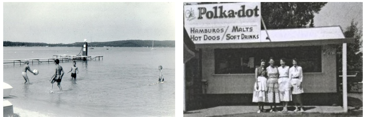
A picture of the marina (1955).

After less than ten years, the Polka-dot was removed, and the Crystal View was built in its place. The land was purchased by the Assembly for $52,000 in 1961, and it included the Crystal View, a gasoline station, and the small marina on the water. Though the idea of a "drive-in" at the Crystal View was proposed, it was voted down in 1970.