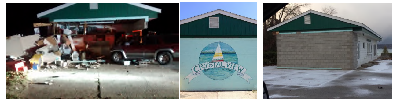
A picture taken by Lou Cenname after the accident.

Despite being around for so long, the Crystal View has been fortunate enough to avoid disaster up until recently. Late at night on October 27th, 2016, a driver speeding down M22 missed the curve in the road and ended up crashing into the back wall of the building. Luckily, no one was harmed, though the driver ran from the vehicle before law enforcement arrived. This crash resulted in the destruction of multiple facilities inside of the restaurant as well as the new mural, but since the crash occurred off-season, repairs were able to be done before the next summer came around.